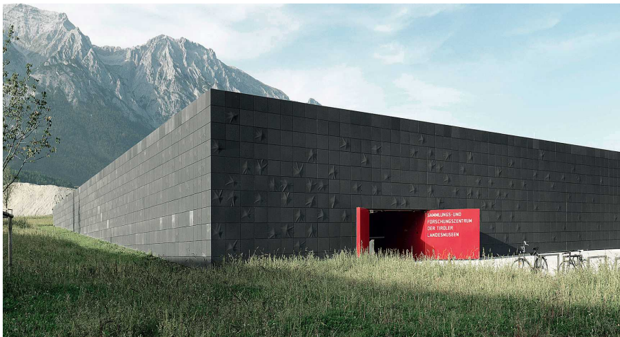
Research and Collection Centre, Hall, AT